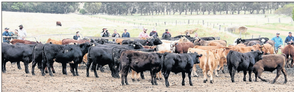
□ The Harvey Beef Gate 2 Plate Challenge will celebrate its 10th anniversary in 2024 and with the milestone celebration will come some changes to both the Challenge and the events surrounding it.

As always, the key focus is to provide a relevant and insightful competition for WA beef producers and these changes will add a new dimension to the event while still providing that valuable