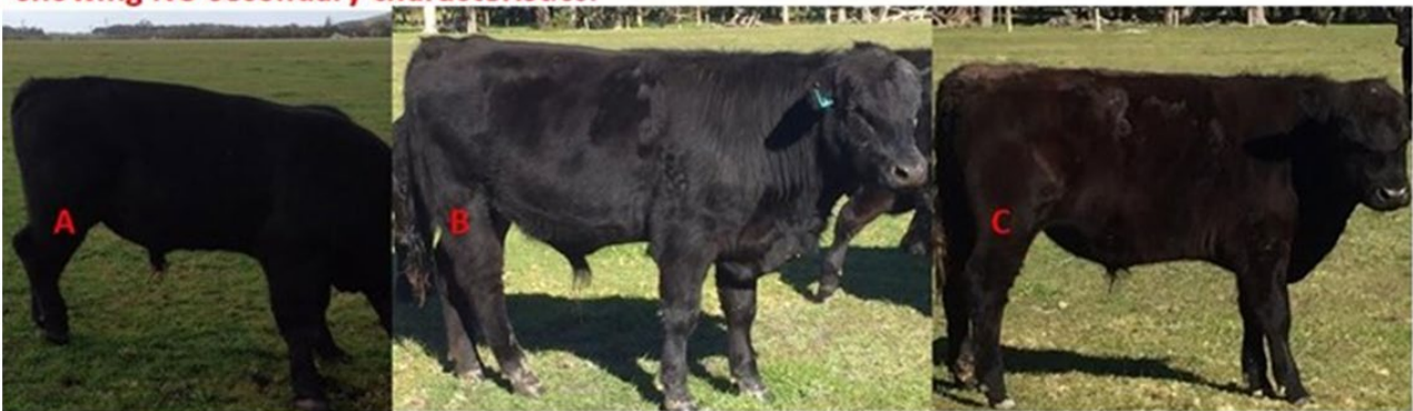
A & B displaying a extended sheath and display of the Old Fella C is showing none of these attributes.

All cattle will be inspected by 5 independent industry scrutineers at penning on the Open Day at Mt Barker Regional Saleyards. Any animal deemed unsuitable for a weaner steer sale will be withdrawn from the competition. This will be a majority ruling.