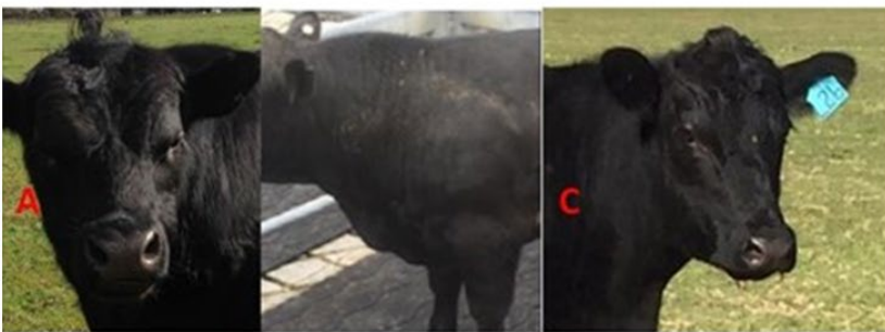
A & B Showing secondary characteristics head/crest C is showing NO secondary characteristics.

All cattle will be inspected by 5 independent industry scrutineers at penning on the Open Day at Mt Barker Regional Saleyards. Any animal deemed unsuitable for a weaner steer sale will be withdrawn from the competition. This will be a majority ruling.